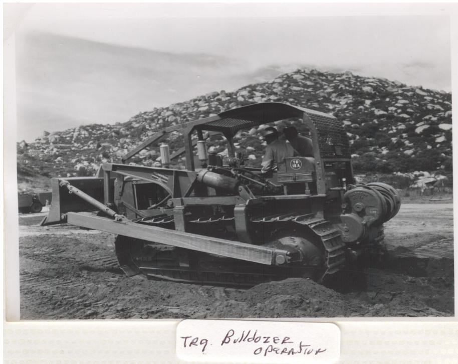
Early Dozer Training at the Ramona Training Center