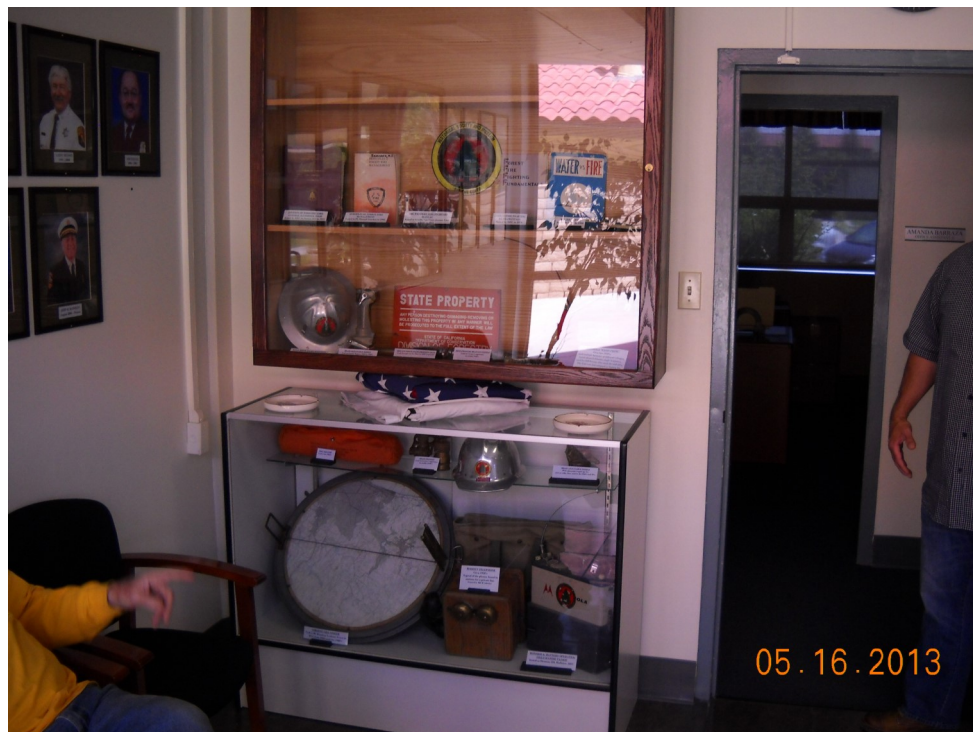
Museum Display at Ben Clarke Training Center