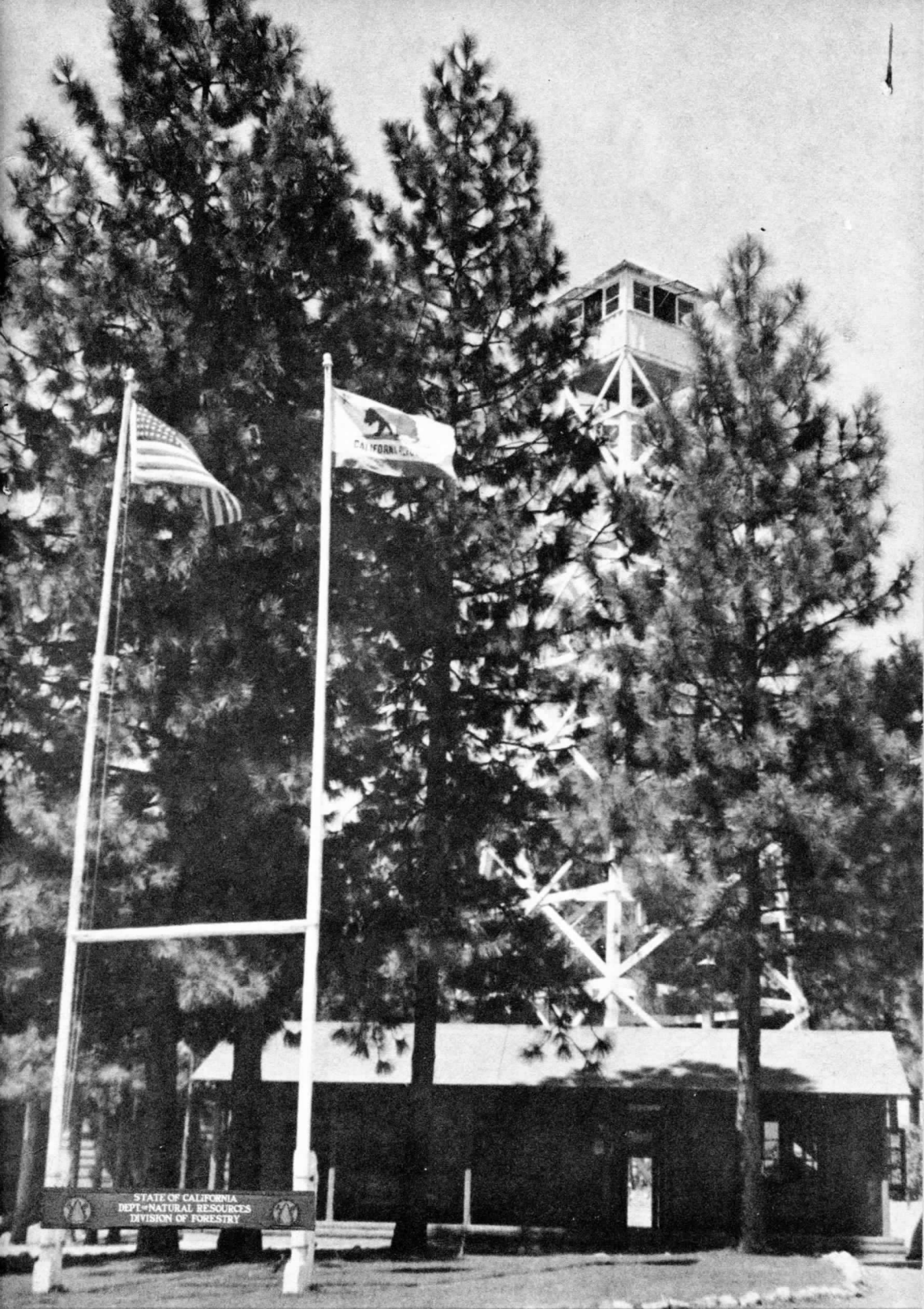
State Forestry Activities--1945