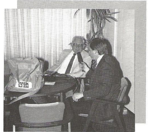
The first media interview for the new director.

(Be sure to catch the Communique' next month when we take a look at "a day in the life" of the new director.)