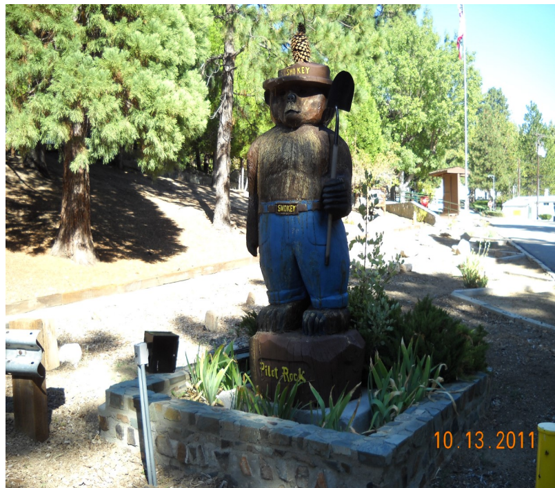
Smoky statue at the entrance of Pilot Rock Camp Pilot Rock Camp is being converted to Seasonal Firefighter because of the reduction of Inmates by CDCR, also McCain Valley, Rainbow and Baseline in the southern half of the state