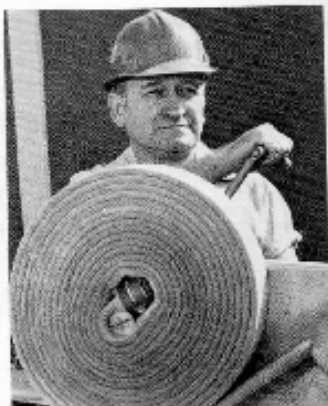
COMPACT NEAT ROLL