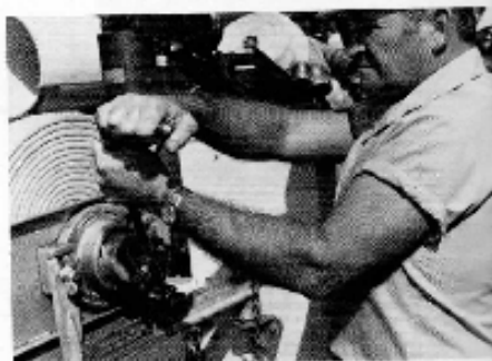
QUICK RELEASE DEVICE