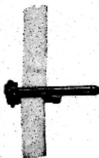
No. 14X670 Forester Hose Shut-Off Clamp Closed

This pocket-sized tool enables one man to instantly shut-off water flow in charged hose lines of 2" or smaller diameters, operating at 200 lbs. hydrostatic pressure. It is particularly convenient when extending "working" hose lines, installing lateral connections in same, or shifting hose without a complete shut-down of the pump, or entire operation. When hose lines burst in service due to deterioration, bursting, or injury, use of this clamp will permit continuing operation and facilitate replacement of damaged lengths. Clamp tension and clearances are designed for use on either Linen or Single Jacketed Rubber Lined Hose, or similar synthetic products.